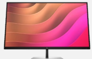
HP E32k G5 Monitor